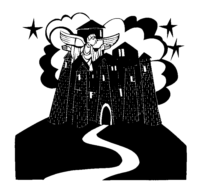
Please choose one